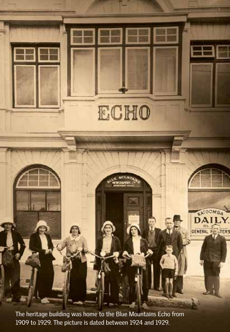
The heritage building was home to the Blue Mountains Echo from 1909 to 1929. The picture is dated between 1924 and 1929.